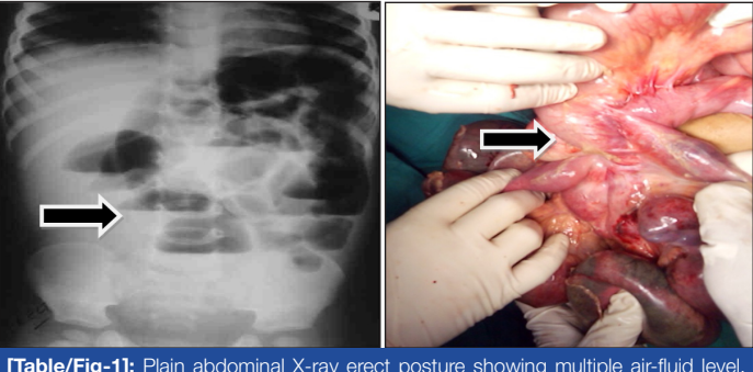
[Table/Fig-1]: Plain abdominal X-ray erect posture showing multiple air-fluid level [Table/Fig-2]: Duplication cyst with twisted gangrenous small bowel loop.

EDC is a rare congenital malformation, first coined by Fiorani C et al., [1]. It can occur anywhere in the GIT from the mouth to the anus with majority of the cases reported in ileum. Ladd AP et al., defined EDC as a tubular or spherical shaped anomaly that is attached or adherent to the normal alimentary tract and shared the similar phenotypic characteristics [2]. It is a separate entity from GIT with their own lumen, which occur either on the mesenteric or the anti-mesenteric side [1]. Several theories exist regarding the